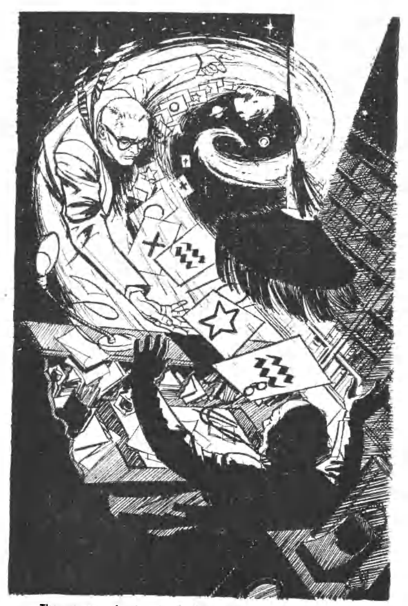
The powers of psi multiplied in ever-expanding sequence.