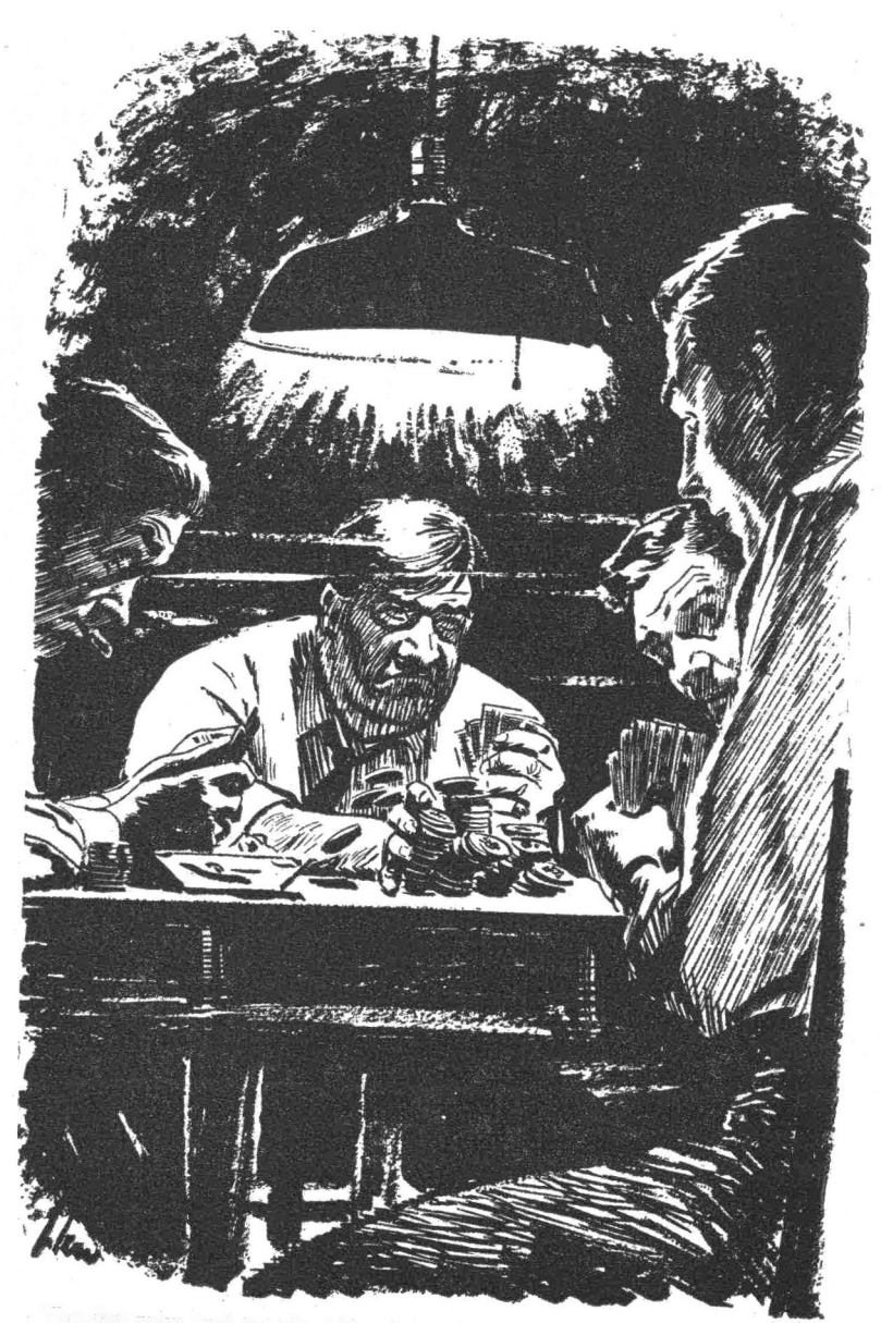
The fat man lost again. Was he softening George for the kill?